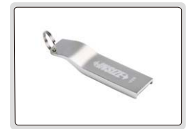
16G USB flash disk (included)