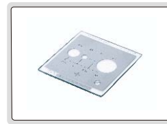
calibration plate (included)