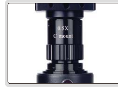
0.5X camera adapter (included)