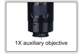
1X auxiliary objective